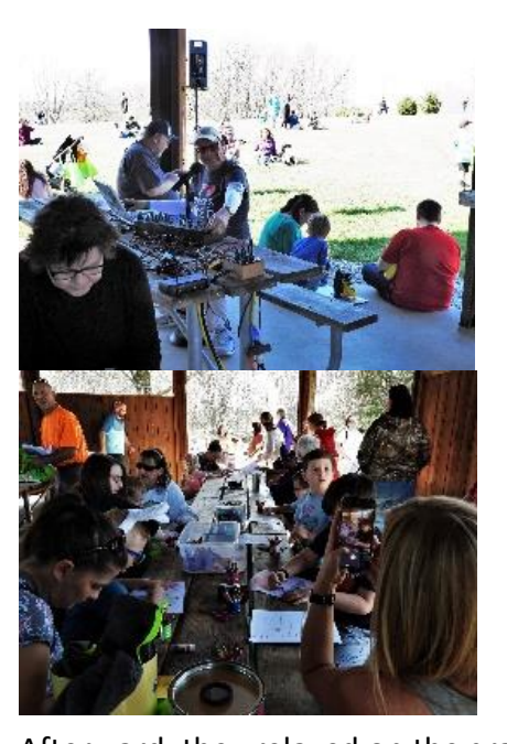
Afterward, they relaxed on the grass as they waited for the egg hunt to begin. Participants were divided into 4 age groups. The eggs were grabbed up quickly and everyone headed for home. We hope they were all happy with the event.