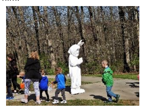
Next, they moved to the line where they were handed a bag of goodies which contained snacks and coupons from area eateries.

Perfect weather brought out a great crowd for the Friends of Codorus Easter Egg Hunt on April 15<sup>th</sup>. It was held at Pavilions 1 and 2 at the Pool/Paddleboat area. Children were greeted by the Easter Bunny upon arrival. Photos could be taken with the big rabbit and many children were happy to see him.